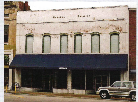
The photograph above shows the building described in the sample application prior to the rehabilitation work. Below left, the building is shown after its successful rehabilitation.